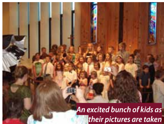
An excited bunch of kids as their pictures are taken