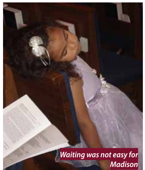
Waiting was not easy for Madison