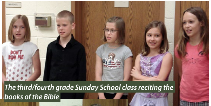
The third/fourth grade Sunday School class reciting the books of the Bible

After the service all went down to Fellowship Hall where the Sunday School kids recited prayers learned during the year and showed posters they created illustrating the Ten Commandments. It was then time for refreshments!