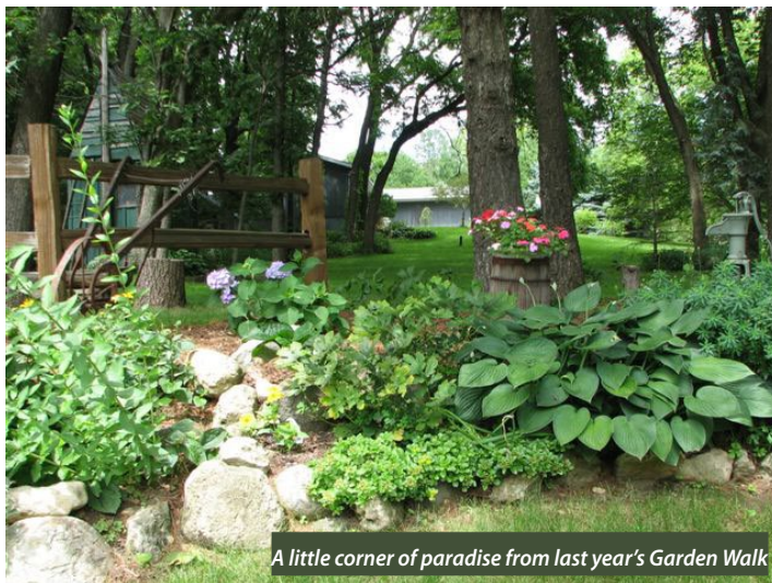
A little corner of paradise from last year's Garden Walk

Save the date for the 2nd Annual St. Martin's Garden