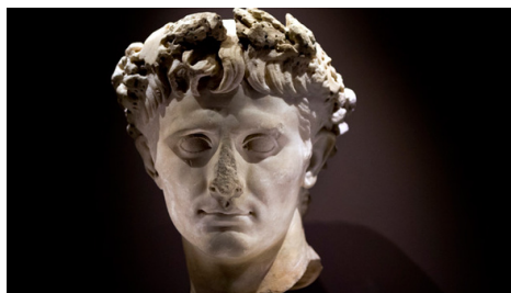
King Herod The Great 74/73 BC to 4 AD